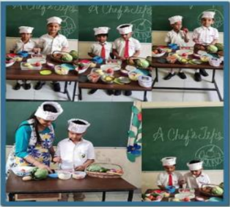
A Chef's Top Activity Class 2