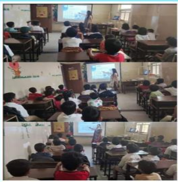
Smart class Class 3