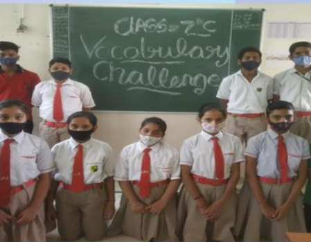
Vocabulary challenge Activity Class 7