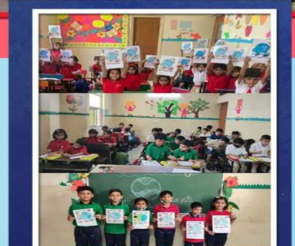
Colouring Activity Class 1