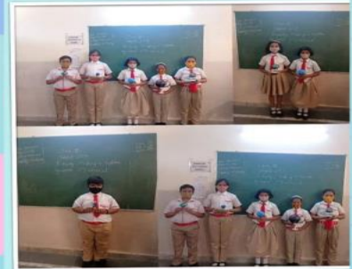
Making The Globe Activity Class 5