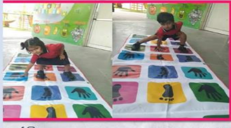
Foot and Mouth Activity