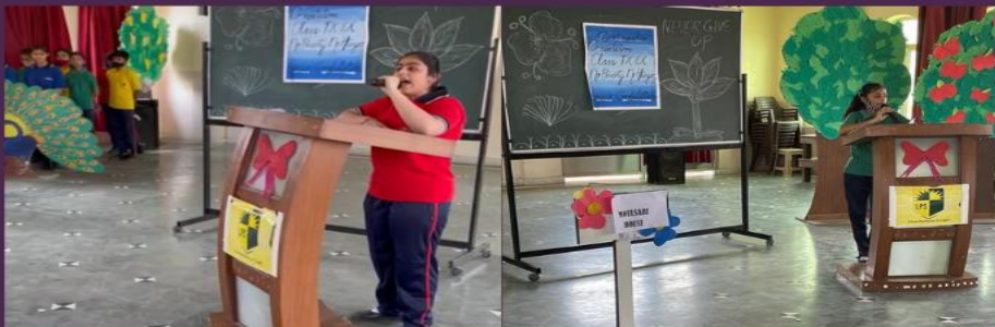
DECLAMATION ( Class 9- 10)