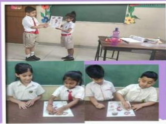
Body Parts Activity Class 2