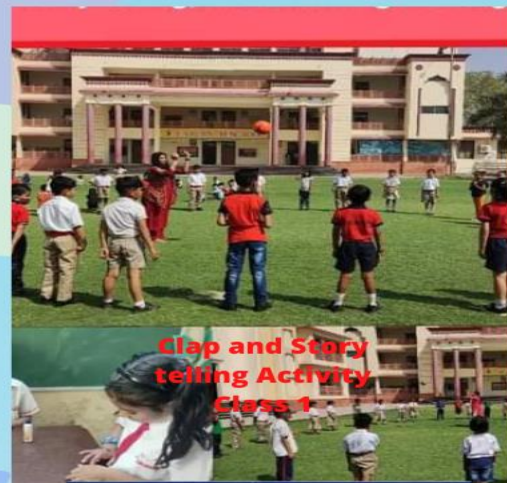
Clap and Story telling Activity Class 1