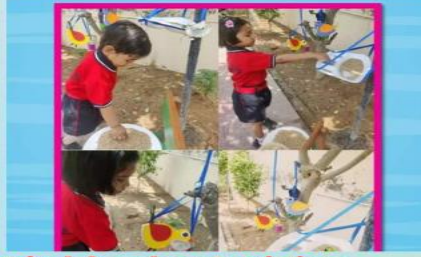
Bird feeder Activity