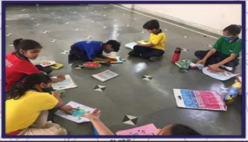
DRAWING ( Class 3-5)