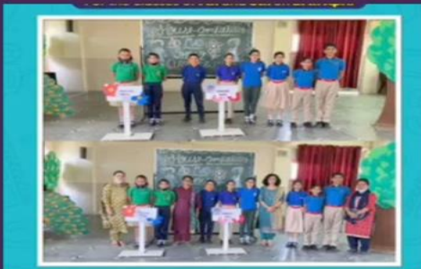
AD-MAD SHOW (Class 7-8)