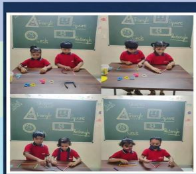
Clay Activity Class 1