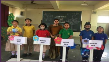
POEM RECITATION (Class 6-7)